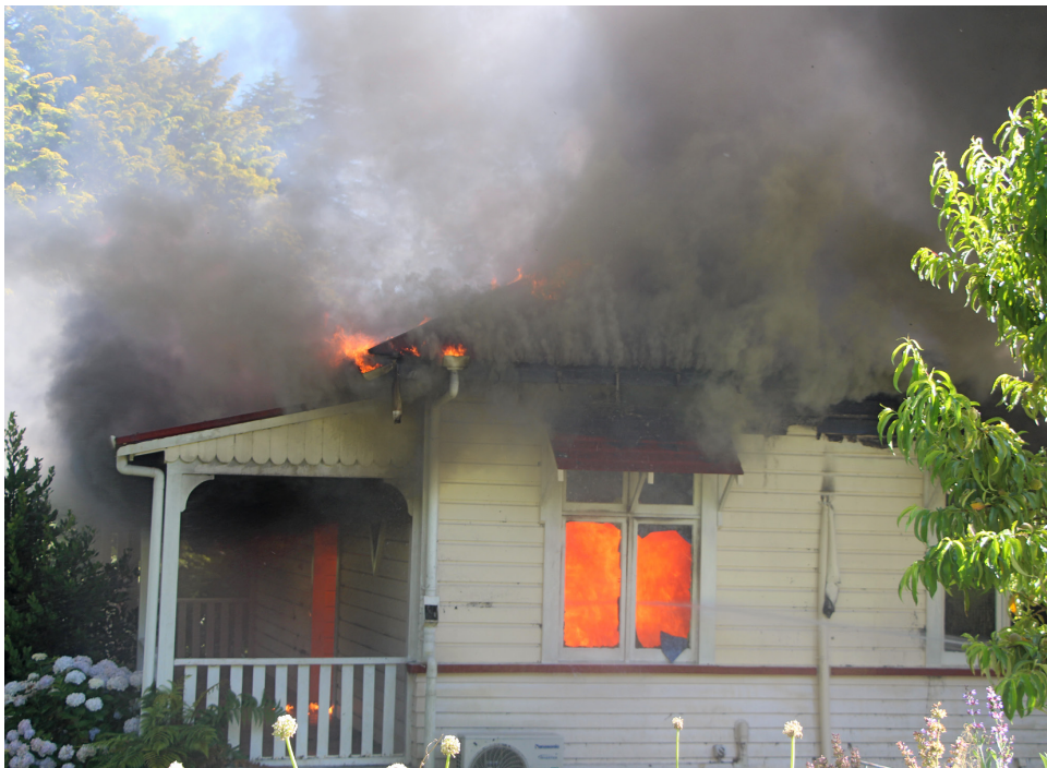
HOMESTEAD ABLAZE: Poututu Station homestead was engulfed in flames yesterday morning with several fire appliances from Wairoa and Nūhaka arriving about 9.15am.